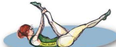
7. SINGLE STRAIGHT LEG STRETCH