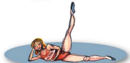
16. SIDE KICKS