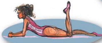
13. SINGLE LEG KICK