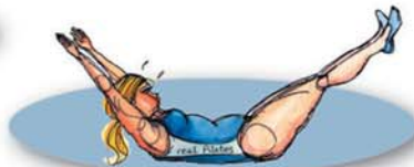
6. DOUBLE LEG STRETCH