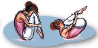
4. ROLLING LIKE A BALL