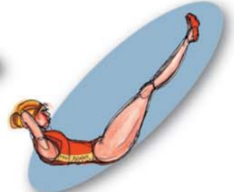
8. DOUBLE STRAIGHT LEG STRETCH