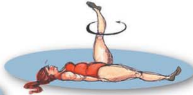
3. LEG CIRCLES