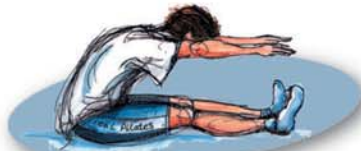
10. SPINE STRETCH