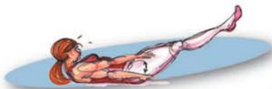
1. THE HUNDRED